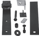
Standard Series Sale Kit - Half Pack