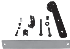
Shutter Series Sales Kit