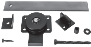
Hidden Roller Series Sales Kit