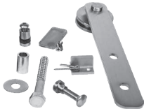
Stainless Steel Series Sale Kit