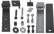
Standard Series Sale Kit - Full Pack