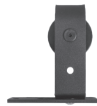
Top mount hangers also available